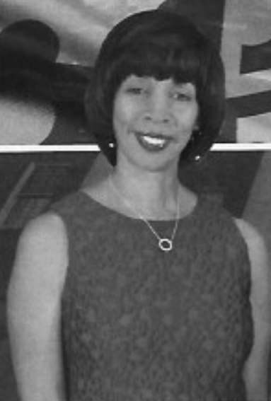
Mayor Catherine E. Pugh